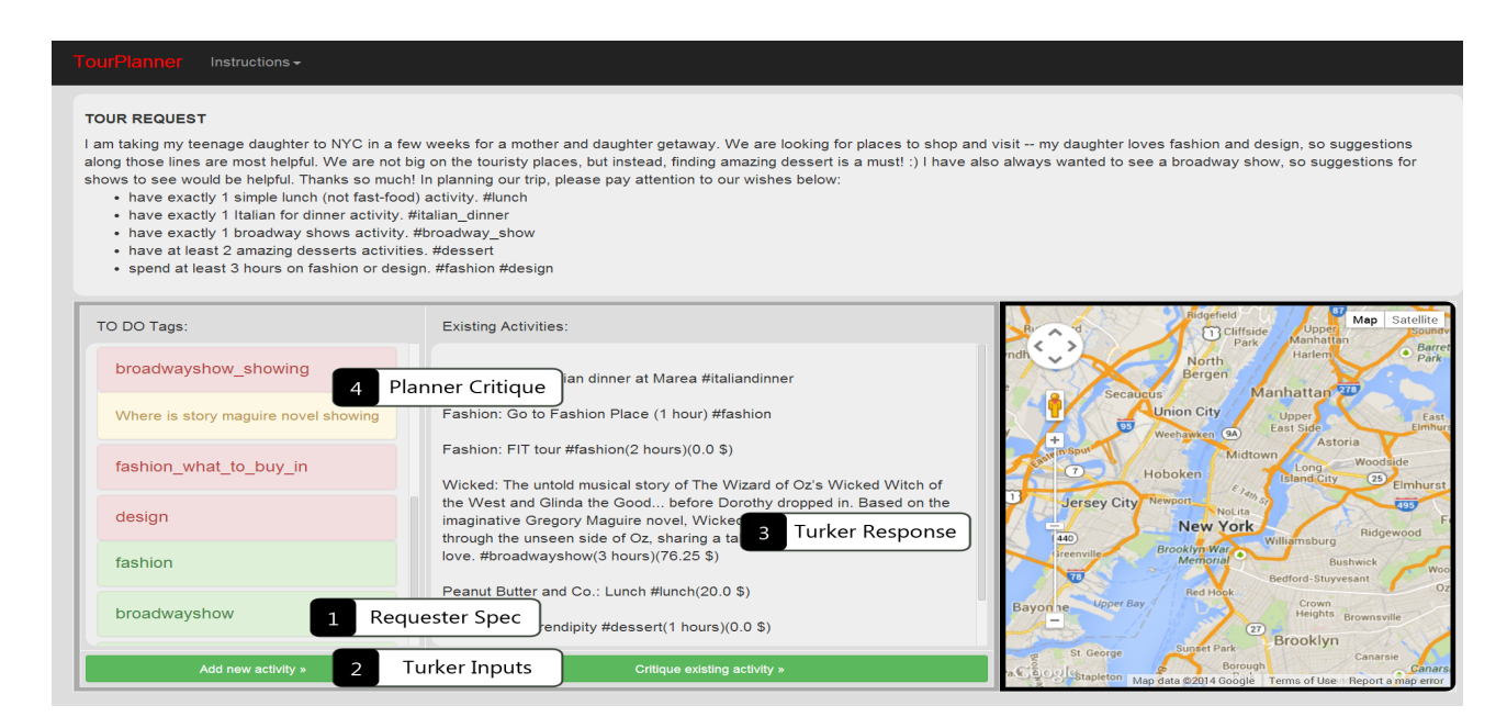
Figure 2: The AI-MIX interface showing the distributed blackboard through which the crowd interacts with the system.

suggestions, or even discover new activities that may satisfy some outstanding tags.