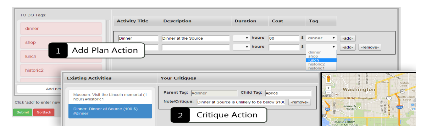
Figure 3: Adding and critiquing activities (plan actions) in the AI-MIX system.

step towards incorporating more sophisticated methods for plan recognition and generation (Talamadupula and Kambhampati 2013). A video run-through of our system can be found at the following URL: http://youtu.be/73g3yHClx90.